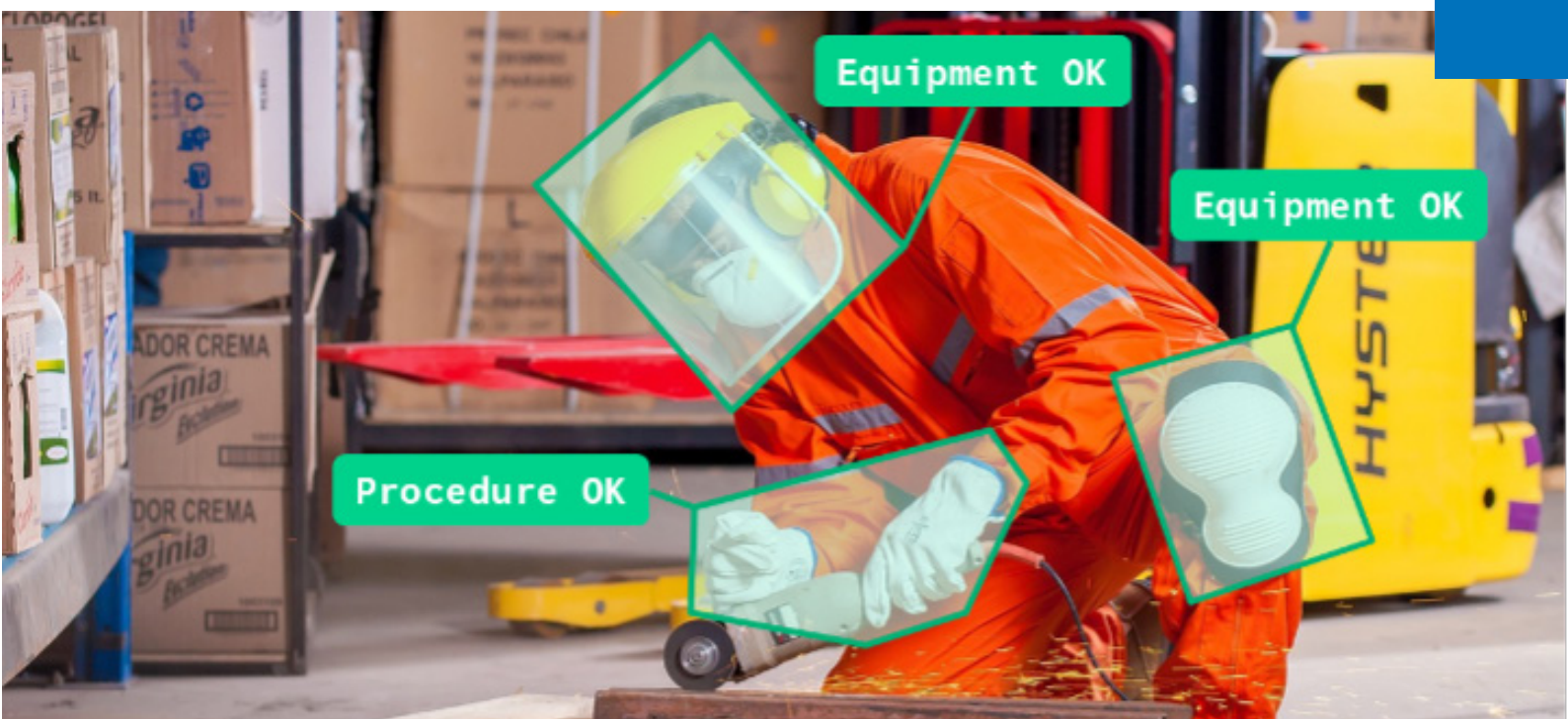
Production guidance use case – illustrative example

As well as improving safety, the system provides proactive intervention to prevent equipment failures, optimize processes, and ensure consistency in operations.